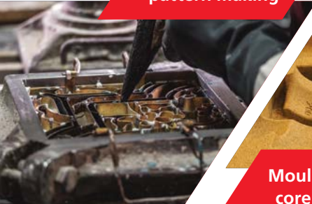
Moulding and core making