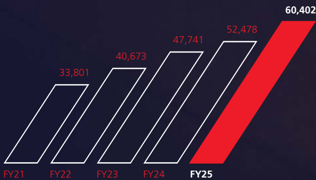
Revenue from Operations (Rs. in lakh)