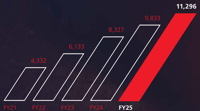
Profit Before Exceptional items and Tax (Rs. in lakh)