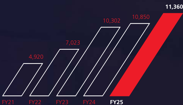
EBITDA (Rs. in lakh)