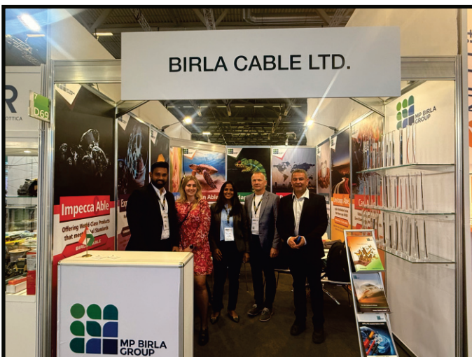
Participation in ANGACOM 2025 held at Cologne, Germany.