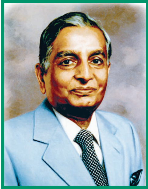
Syt. Madhav Prasadji Birla (1918-1990)