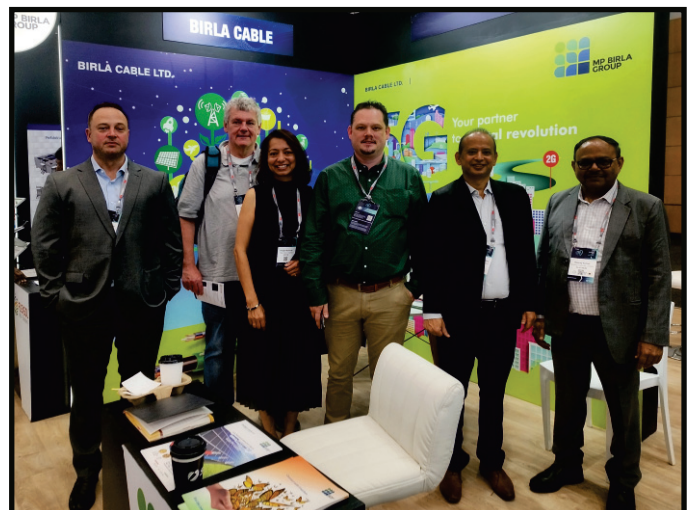
Participation in AFRICACOM 2025 held at Cape Town, South Africa.