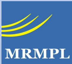
Multireach Media Private Limited