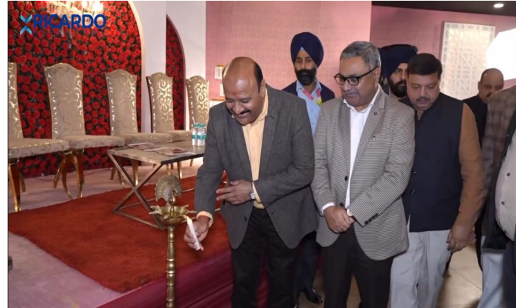
Inaugurated by Sh. Surinder Kumar Choudhary, Hon'ble Deputy Chief Minister, UT of J&K · Trikuta Nagar, Jammu